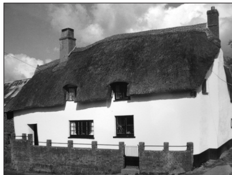
Above: Way Farm house.